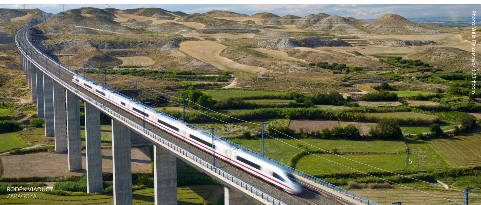
RODÉN VIADUCT ZARAGOZA