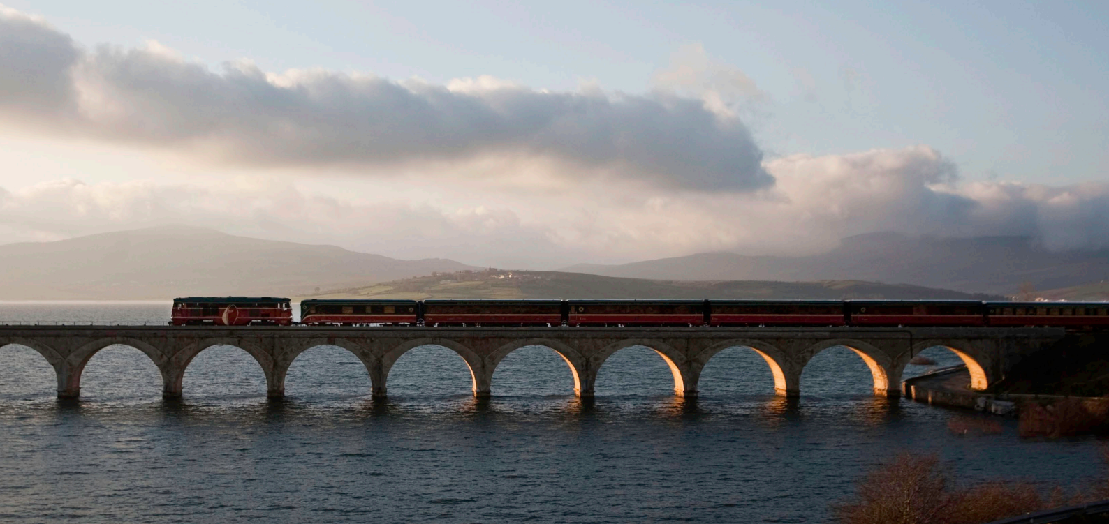
▲ LA ROBLA EXPRESS