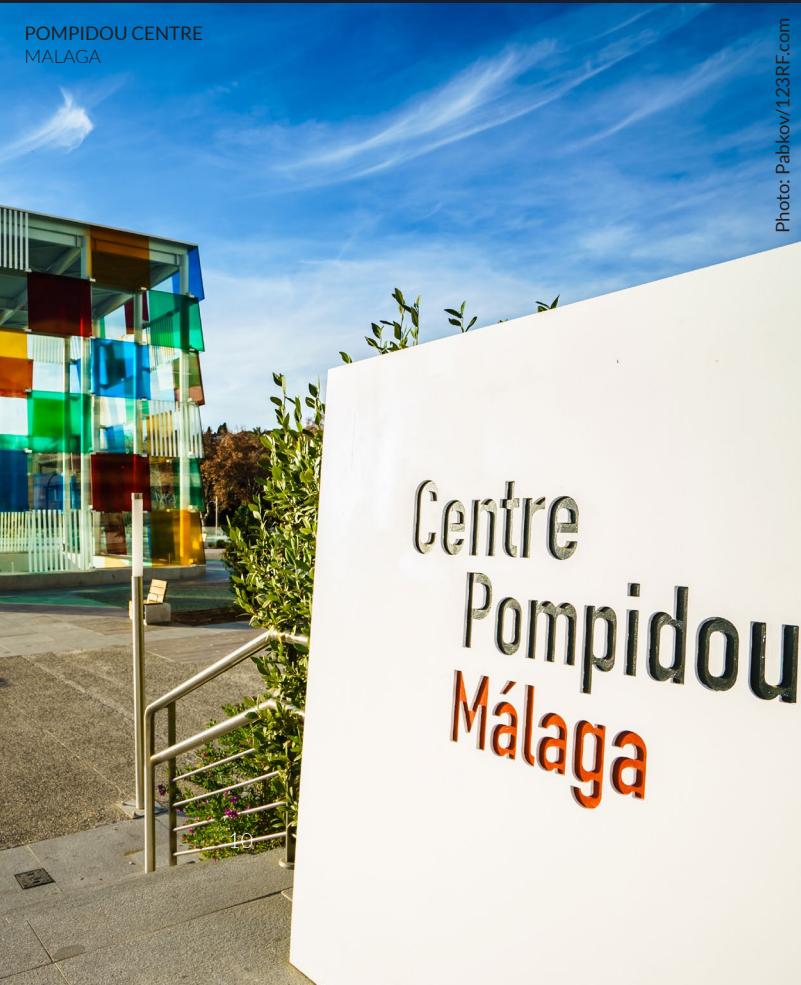
POMPIDOU CENTRE MALAGA

It's only around two hours thirty minutes from Madrid to the Mediterranean city where the amazing artist Pablo Picasso was born.