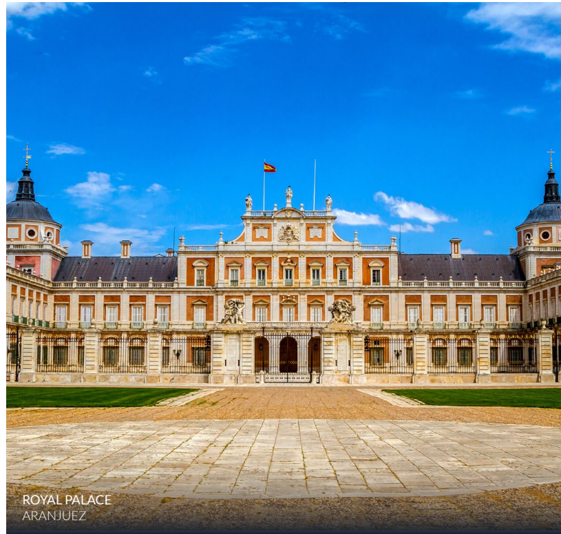
ROYAL PALACE ARANJUEZ

Another option while you're in Madrid is to climb aboard the Strawberry Train . This will take you to Aranjuez , a beautiful historic town about 50 kilometres from Madrid. This is a perfect excursion