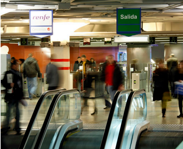
▲ PUERTA DE ATOCHA STATION MADRID

While you're in Madrid, take the Medieval Train and combine history, theatre and gastronomy in a single day. It takes no time at all to reach Sigüenza in Guadalajara, you'll spend about an hour and a half immersed in a Medieval atmosphere surrounded by actors playing the roles of typical characters from the era: troubadours, stilt walkers, jugglers. You'll even be served typical sweets while you're on board. When you reach your destination you'll be shown around the town by local guides. You'll be fascinated by the majestic cathedral, the castle and the Plaza Mayor square. There'll be typical dishes like traditional breadcrumbs and Castilian soup and for dessert you should try some Doncel egg yolks.