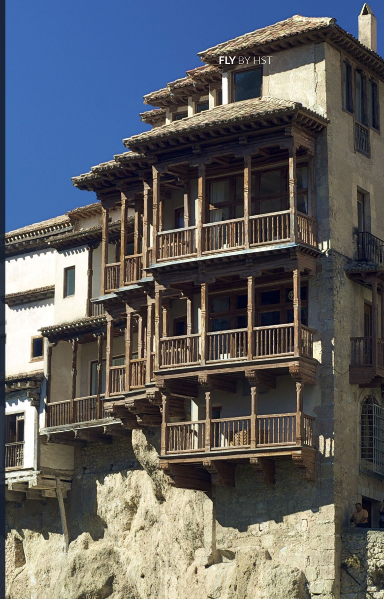
► HANGING HOUSES CUENCA

Castelló de la Plana and Murcia are also within reach from Madrid on a high-speed train; the journey is around three hours.