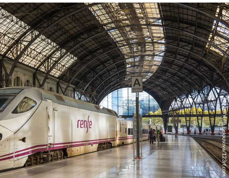
▲ FRANCIA STATION BARCELONA