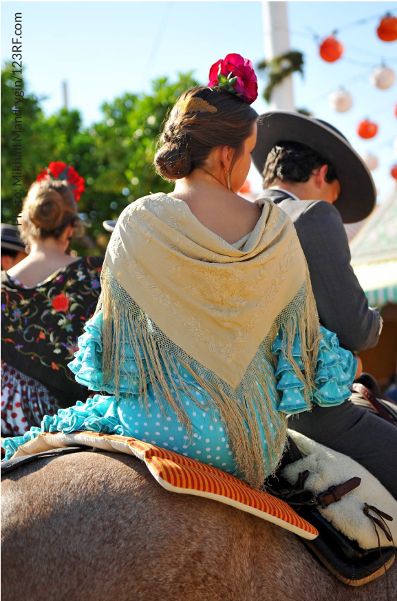
▲ APRIL FAIR SEVILLE