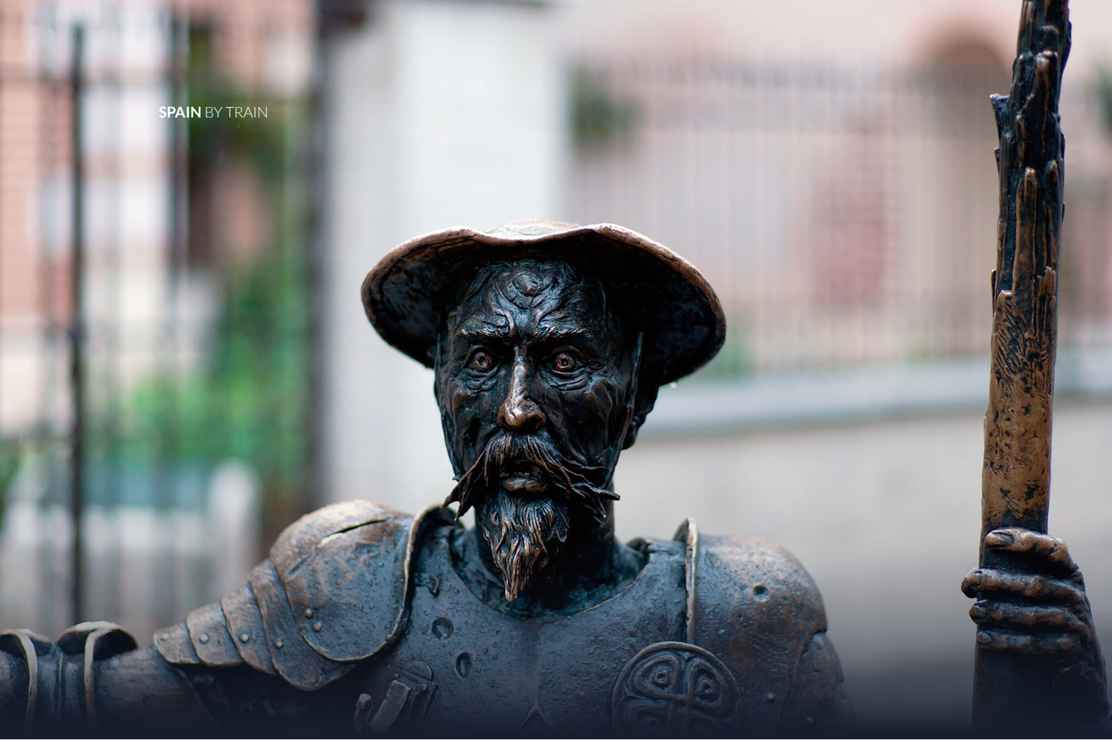
▲ SCULPTURE OF DON QUIXOTE ALCALÁ DE HENARES (MADRID)