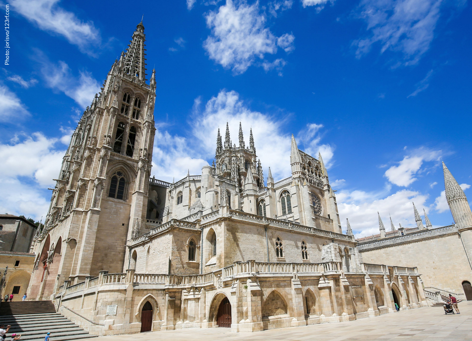
▲ CATHEDRAL BURGOS