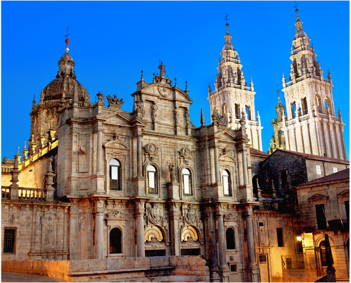
▲ SANTIAGO CATHEDRAL SANTIAGO DE COMPOSTELA