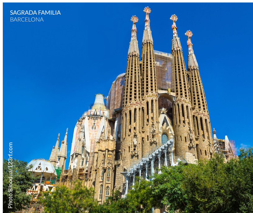
SAGRADA FAMILIA BARCELONA