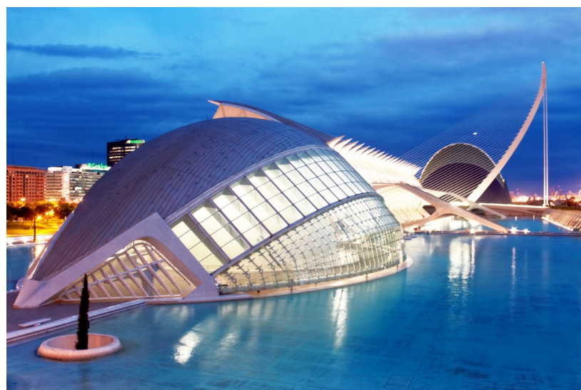
▲ CITY OF ARTS AND SCIENCES VALENCIA

① For more information on HST routes and timetables, click here: www.renfe.com