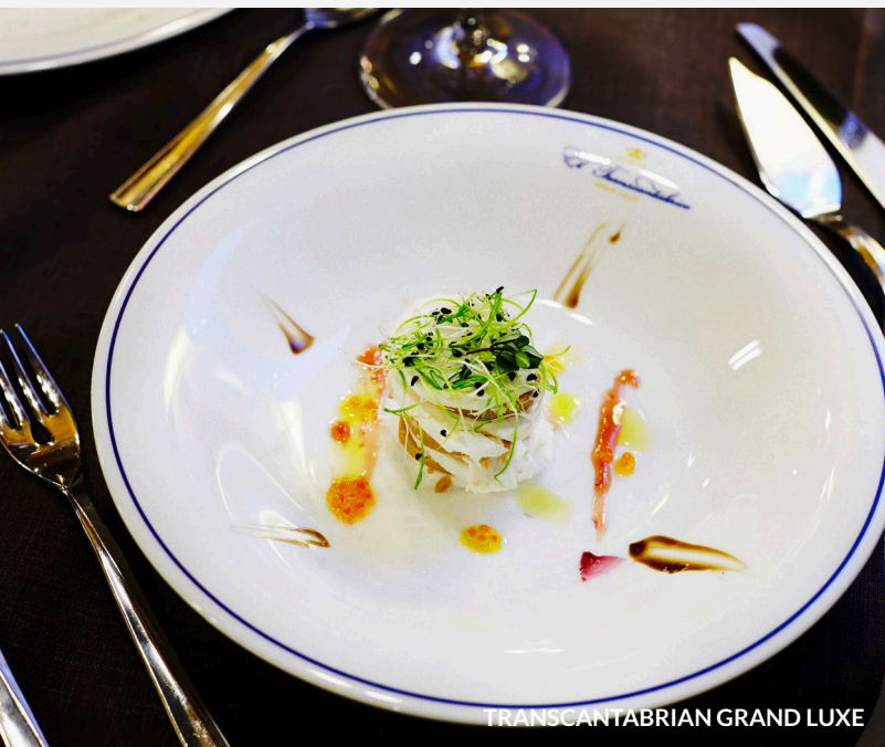
TRANSCANTABRIAN GRAND LUXE

As you travel through the Basque Country, Cantabria, Asturias and Galicia you'll be able to enjoy the exquisite cuisine which characterises northern Spain. Both on the train and elsewhere, you'll get to try typical, traditional dishes prepared by internationally renowned chefs. From a typical white-bean stew and mountain casserole to baked fish, anchovies and seafood. And not forgetting sweets, pies, cured meats and the best wines of these regions. Those with special dietary requirements can request a special menu at the time of booking.