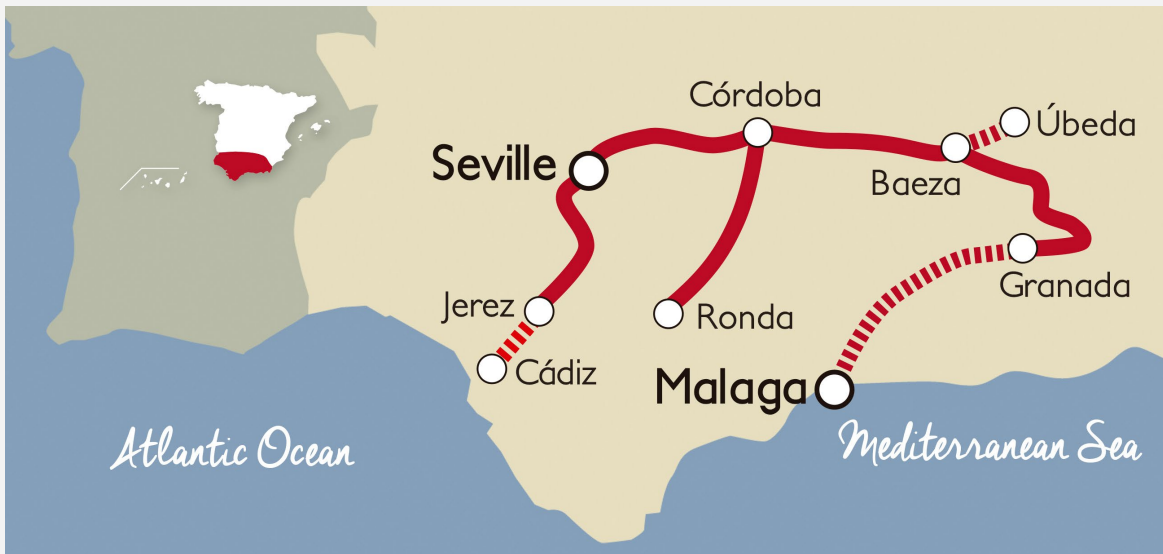
▲ AL-ANDALUS TRAIN ITINERARY