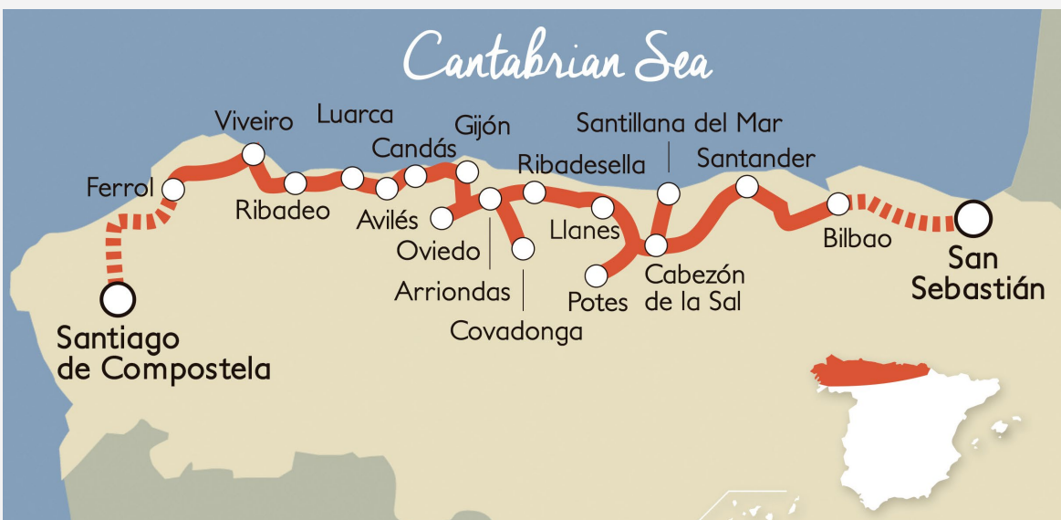
▼ TRANSCANTABRIAN GRANDE LUXE TRAIN ITINERARY

You'll be able to rest in one of the 14 carefully decorated luxury suites and enjoy the beautiful landscapes as they pass by the window of your private lounge or the large windows in one of the original saloon cars from 1923, real gems of our historic railway heritage.