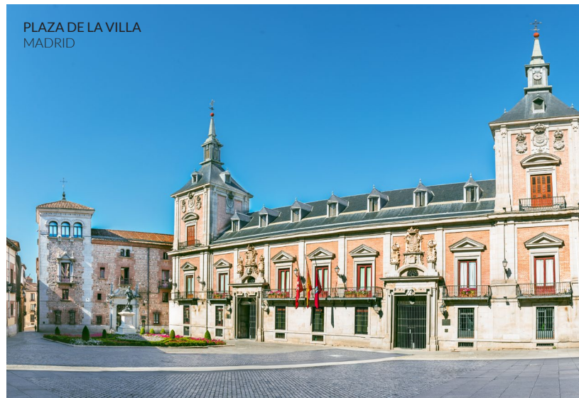
PLAZA DE LA VILLA MADRID

You'll just love this cosmopolitan, avant-garde, Mediterranean city which is full of surprises. Moving around on foot or bicycle you can discover neighbourhoods such La Rambla and the sea-front promenade. Deep in the renowned Gothic Quarter you'll feel like you're back in the Middle Ages. Take a leap forward to Catalan Modernism with Antoni Gaudí: you'll be impressed by his masterpieces, the Sagrada Familia or the Park Güell , both World Heritage Sites. Check out the city's incredible cultural agenda and sign up for exhibitions, concerts, functions... You'll love the cuisine in Barcelona which is a perfect blend of tradition and creativity. Give yourself a treat: try the craft pastries and sparkling wines. You can also take the HST to Barcelona from many other cities, like Malaga.