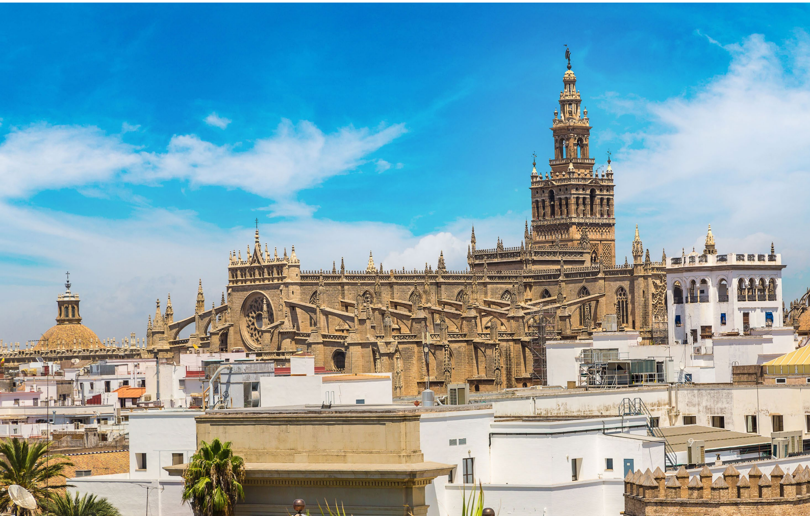
▼ CATHEDRAL OF SANTA MARÍA DE LA SEDE SEVILLE

If your visit coincides with Easter Week or the April Fair you'll be able to take part in one the most impressive popular festivals in the country.