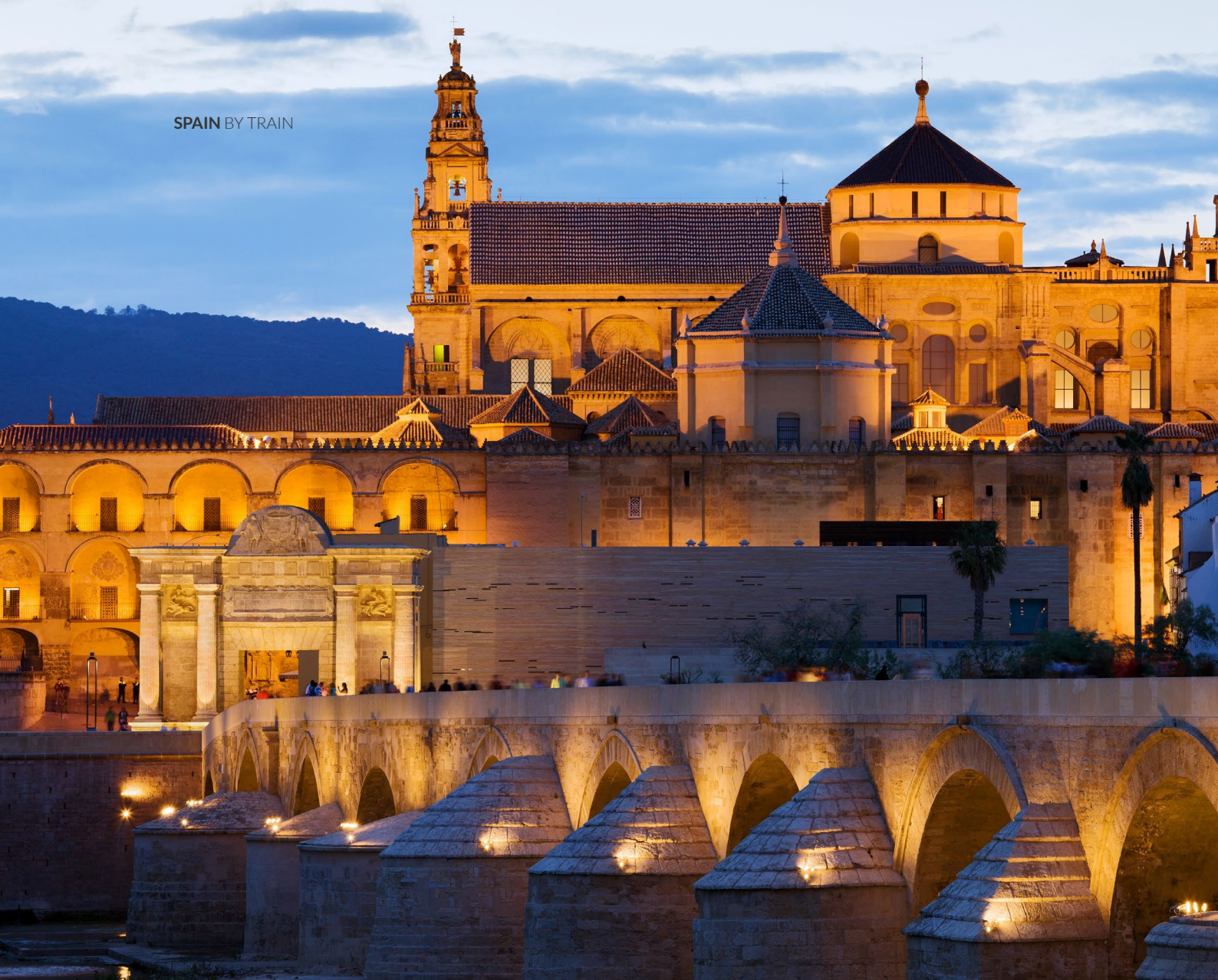
▲ MOSQUE-CATHEDRAL CORDOBA