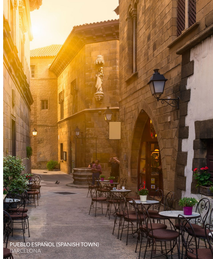
PUEBLO ESPAÑOL (SPANISH TOWN) BARCELONA

Some of the corners of the city shown in Perfume: The Story of a Murderer are not so well known. We are talking about Laberint d'Horta Park , in the north of the city, with its intricate maze of cypresses, temples, fountains and mythological sculptures. And Poble Espanyol , an open-air architectural museum located at the foot of Montjuïc hill, with scaled reproductions of buildings, squares and streets representative of various Spanish cities. Its main square is the scene of the film's culminating moment.