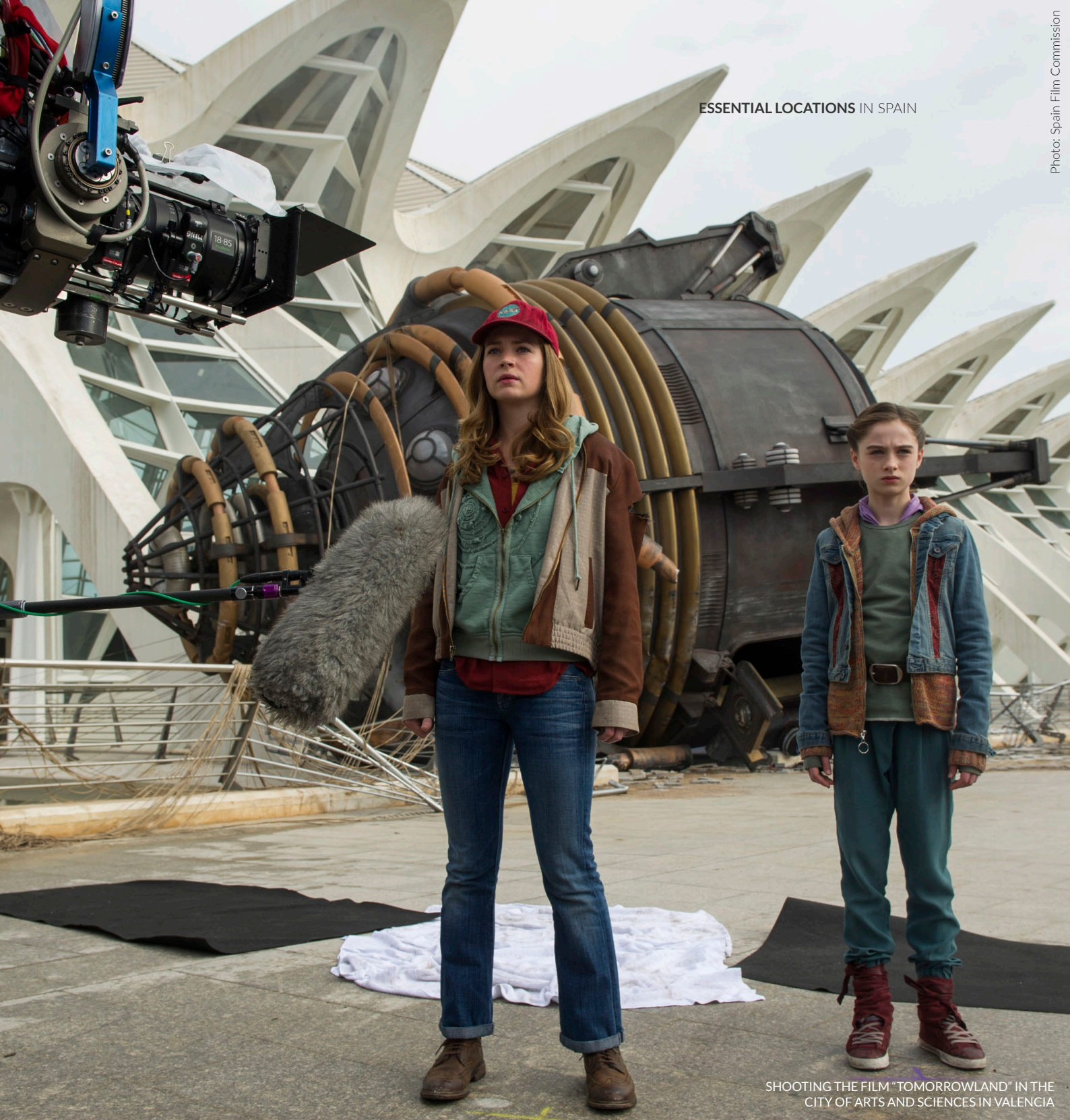
SHOOTING THE FILM "TOMORROWLAND" IN THE CITY OF ARTS AND SCIENCES IN VALENCIA

complex are L'Oceanogràfic, the largest aquarium in Europe, and L'Hemisfèric, with its appearance of a huge white eye. Complete your tour by seeing the Palau de les Arts auditorium, a building designed in the form of an immense sculpture.