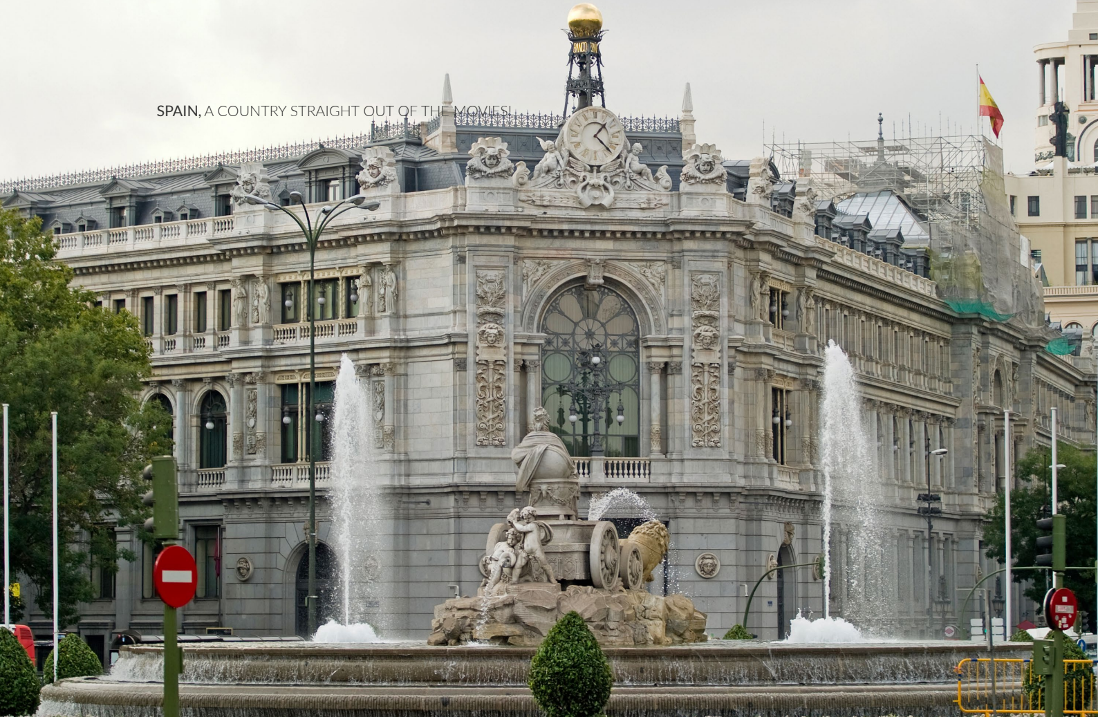
▲ BANCO DE ESPAÑA MADRID

dinner in very original places and for making your more alternative purchases.