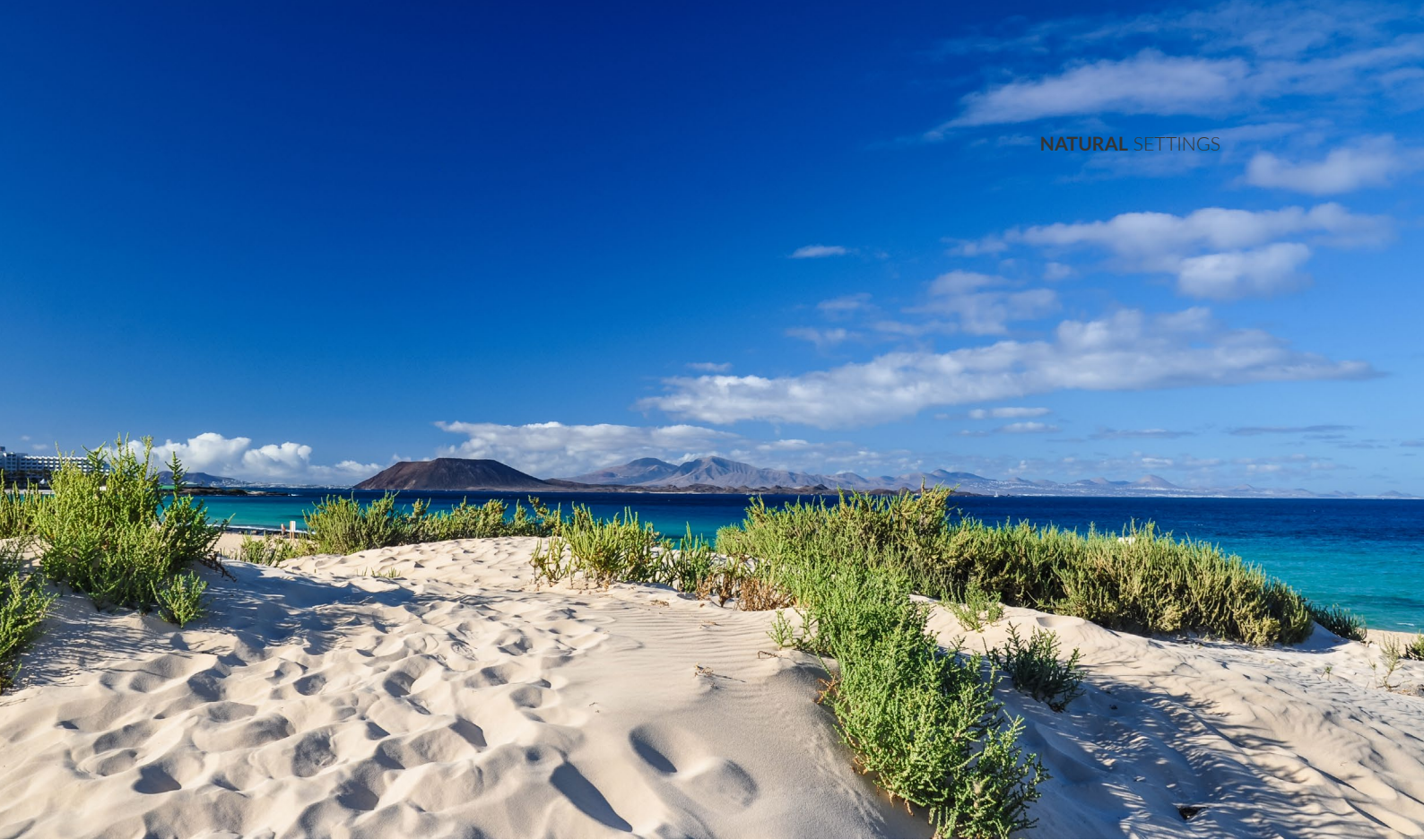
▲ CORRALEJO NATURAL PARK FUERTEVENTURA

Clash of the Titans , by Louis Leterrier, allows us to see what the Teide, an inactive volcano in the centre of the island of Tenerife and the highest peak in Spain, might look like when active. Teide National Park was used to replicate the mythological underworld in which much of the film takes place.