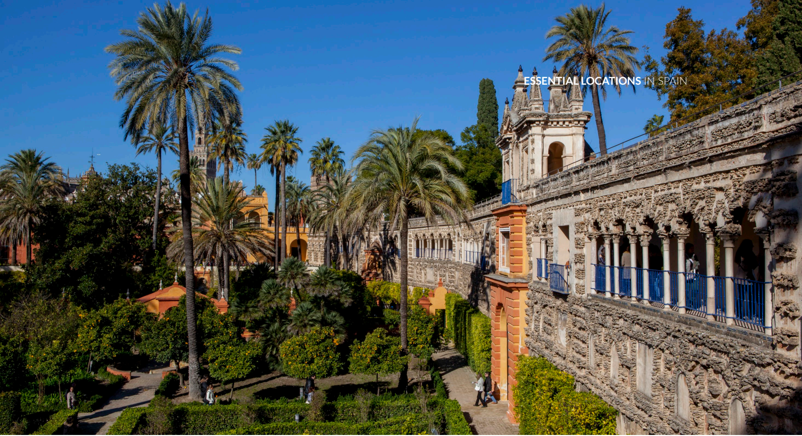
▲ THE MERCURY POOL GARDEN REAL ALCÁZAR PALACE, SEVILLE

Casa de Pilatos is another of the places that captivated Scott, who chose this palace in Italian-Mudéjar Renaissance style as the location for the residence of the Roman praetor in Jerusalem. Take a look inside and go into the very beautiful gardens, typical of noble palaces in the city centre, with beautiful plaster skirting and Plateresque style grilles.