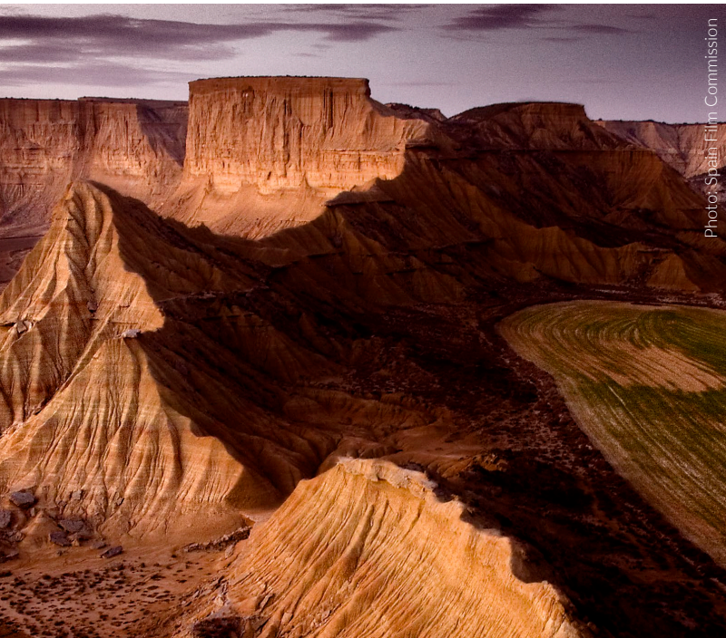
▲ BARDENAS REALES NAVARRE

Next we travel to Girona , where we can discover such places as San Pedro de Galligans Monastery , now the Archaeological Museum of Catalonia. Its interior was used to recreate the library where Sam Tarly attempted to become a maester and made great discoveries about the complex genealogical tree of the Westeros families.