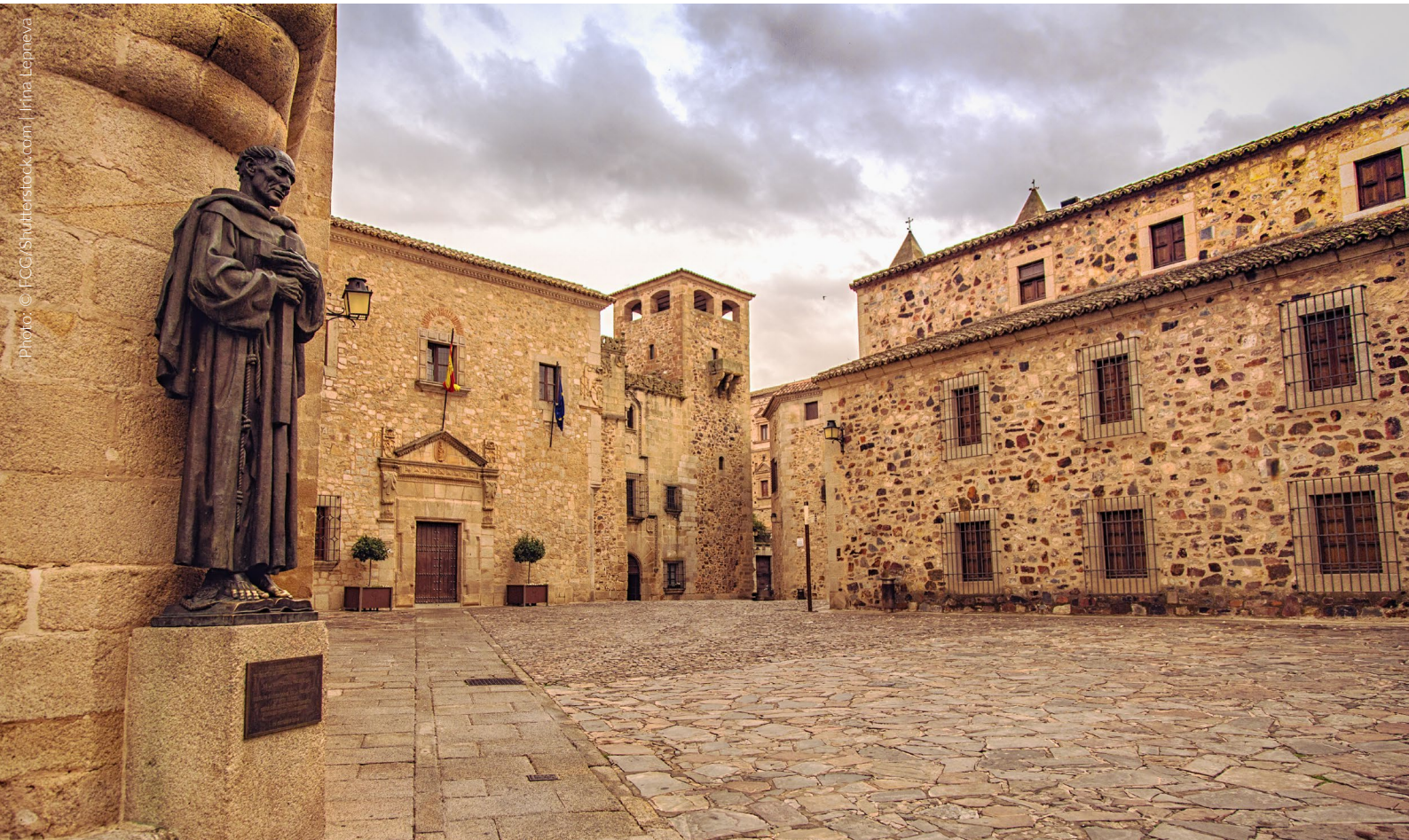
▲ PLAZA DE SANTA MARIA AND STATUE OF SAN PEDRO DE ALCANTARA CACERES

Seville and its Moorish architecture have given life to the southern kingdom of Dorne, the home of House Martell. In the heart of this beautiful city stands the Real Alcázar , UNESCO World Heritage Site. This architectural complex was used to recreate the Water Gardens, the private residence of the Lord of Sunspear. Stroll among fountains, orange trees and palm trees that provide a real spectacle for the senses. See for yourself the ruins of Dragonpit, the place where the faces of the saga's two most powerful queens, Cersei Lannister and Daenerys Targaryen,