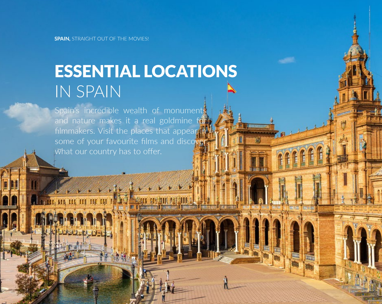
▲ PLAZA DE ESPAÑA SEVILLE

Spain's incredible wealth of monuments and nature makes it a real goldmine for filmmakers. Visit the places that appear in some of your favourite films and discover what our country has to offer.