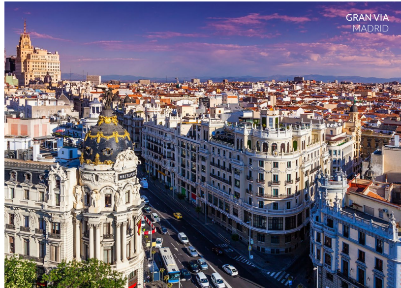
GRAN VÍA MADRID

The Way , about the meaning of walking the Camino de Santiago, was filmed in beautiful locations in northern Spain. The film starred Martin Sheen, directed by his son Emilio Estévez.