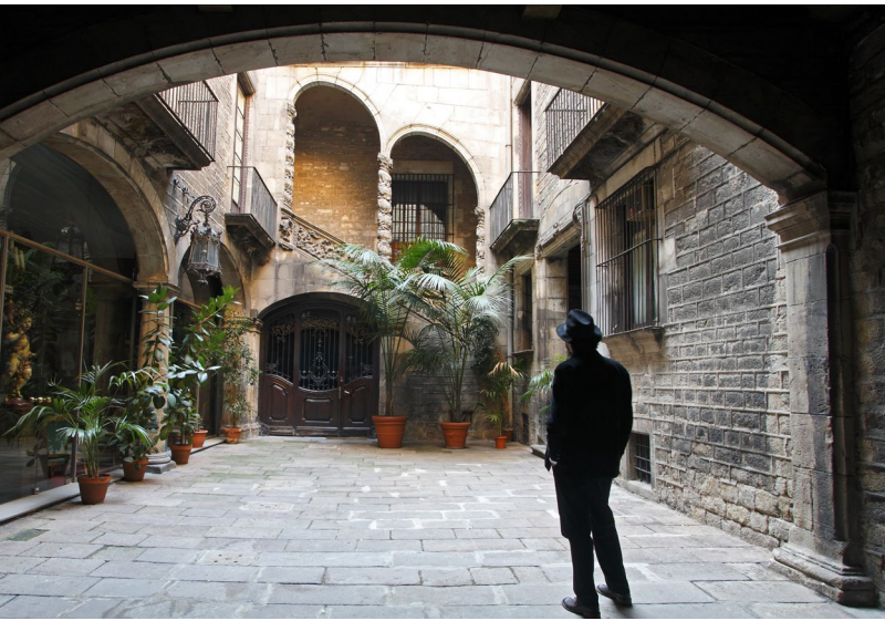
▲ GOTHIC QUARTER BARCELONA

Perfume: The Story of a Murderer , based on the bestseller by Patrick Süskind and directed by Tom Tykwer, is another perfect feature film for discovering the charms of Barcelona, here converted into 18th century Paris. The narrow streets of the Gothic Quarter are the setting for the wanderings of Grenouille, the film's protagonist. There you can see the city's Roman past, ruins of ancient walls, the narrow streets of the Jewish quarter, the Gothic cathedral and the most important of its palaces.