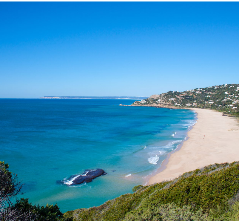
▲ LOS ALEMANES BEACH, ZAHARA DE LOS ATUNES CADIZ