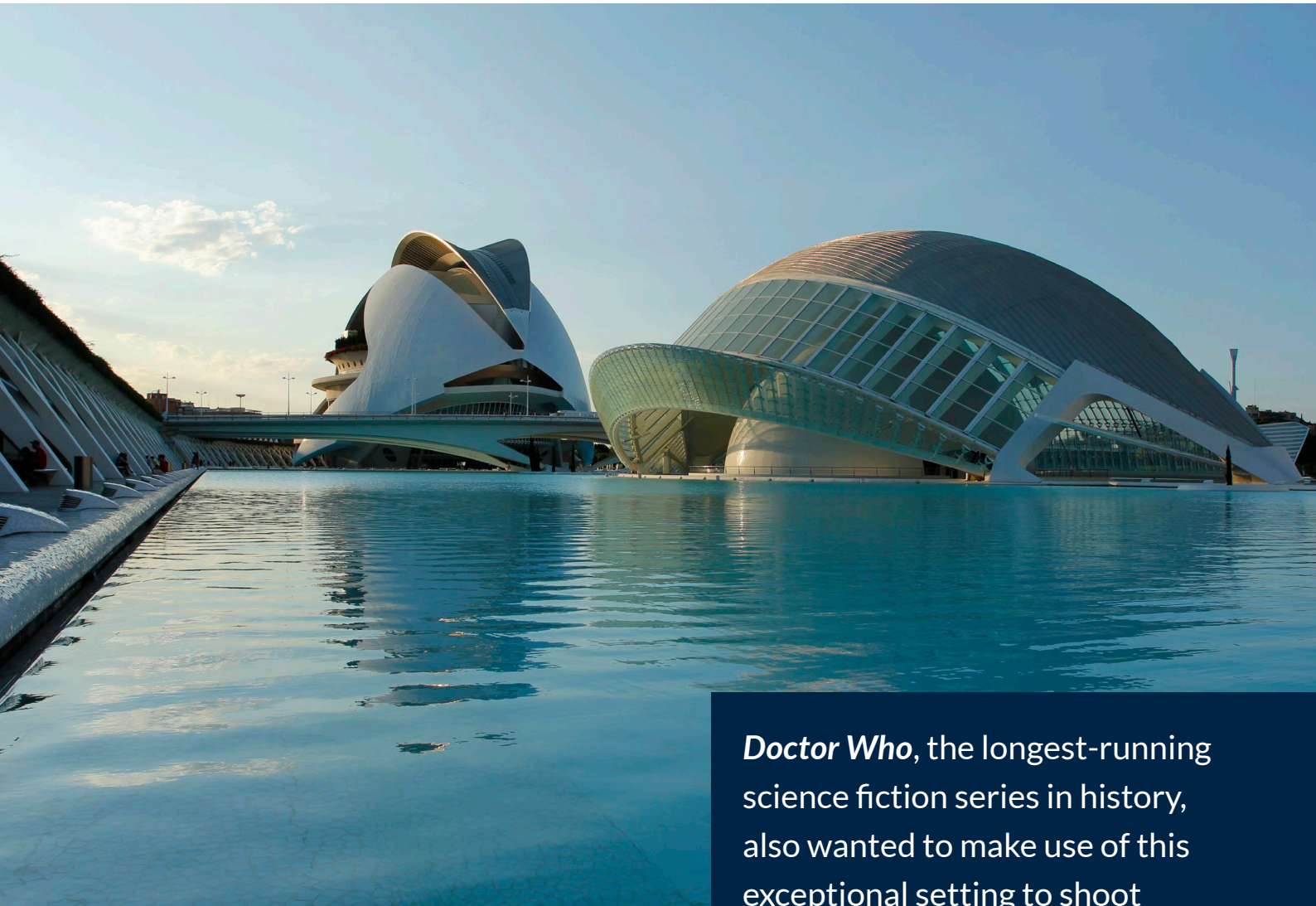
▲ CITY OF ARTS AND SCIENCES VALENCIA