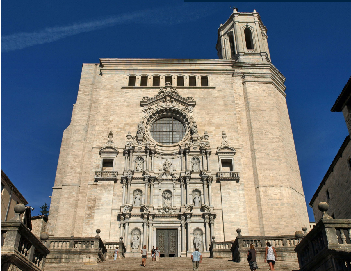
CATHEDRAL OF SANTA MARÍA IN GIRONA

The cobbled streets of the historic district of Girona played host to Arya lost in Braavos and the spectacular steps of its cathedral were used to recreate the Great Sept of Baelor in King's Landing. You will not be able to climb them on horseback, as Jaime Lannister did, but you will be amazed by their imposing size.