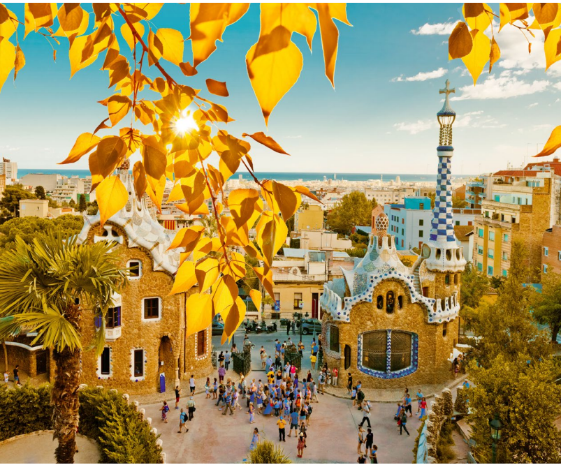
▲ GÜELL PARK BARCELONA