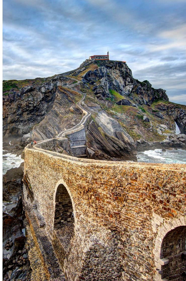
▲ SAN JUAN GAZTELUGATXE SHRINE BIZKAIA

In addition to setting Westeros here, the series' producers have made use