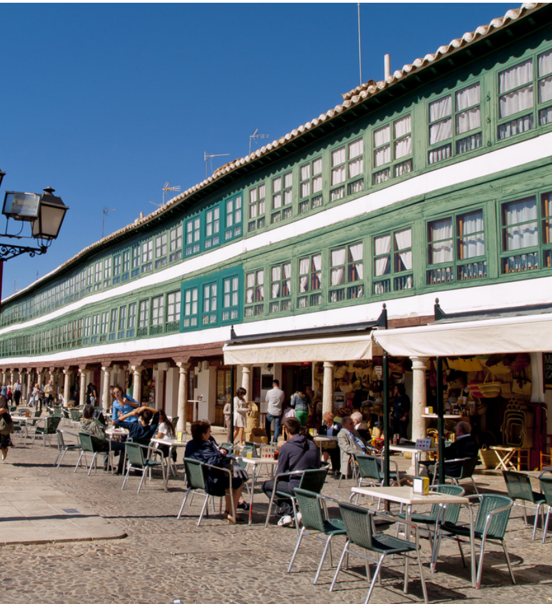
▲ ALMAGRO CIUDAD REAL

In Manises (Valencia) you should visit the pottery workshops and shops in the historical old town. There you can learn how the famous Valencian pestles and mortars are manufactured and the technique for metallic-lustre ceramics. And you could paint your own medieval-style "Socarrat" tile or create something on a potter's wheel.