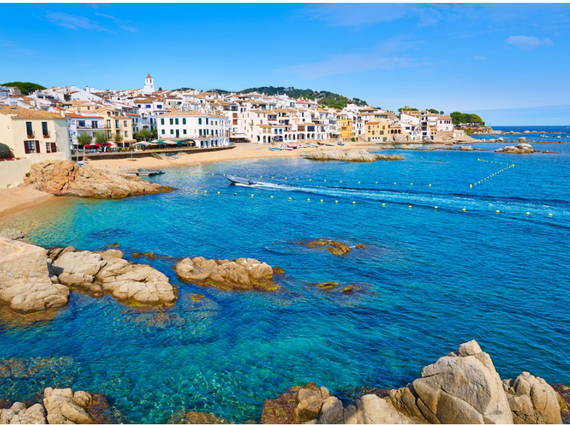
▲ CALELLA DE PALAFRUGELL GIRONA