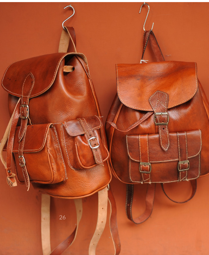
◀ UBRIQUE CÁDIZ

With nearly 40 workshops, Ubrique , in the Sierra de Cádiz mountains, is paradise for lovers of traditionally hand-made leather goods. Visit the ancient convent of the Capuchin monks, where you'll also find the Leather Museum. In the cloister you can see the changes in the different machines used in the manufacturing process, and even make your own simple leather bag in a replica of a traditional leather workshop.