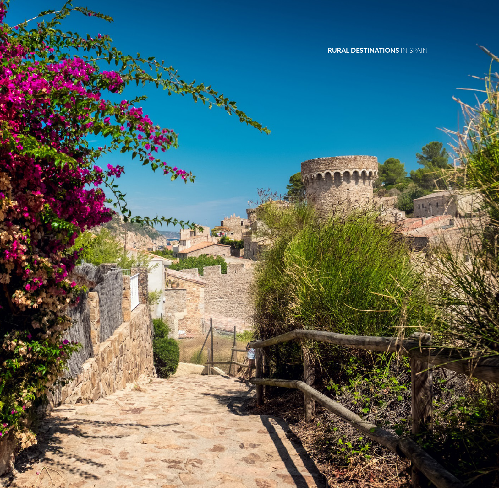
▲ TOSSA DE MAR GIRONA

the sea and take an excursion to the Greco-Roman remains in Empúries , one of the most important archaeological sites in Spain.