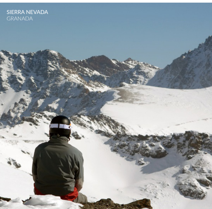
SIERRA NEVADA GRANADA

This area is typical for cortijos , traditional farmhouses in rural Andalusia, which are usually in large estates and have cottages and other farm buildings.