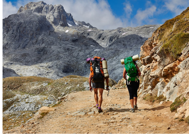
▲ PICOS DE EUROPA CANTABRIA