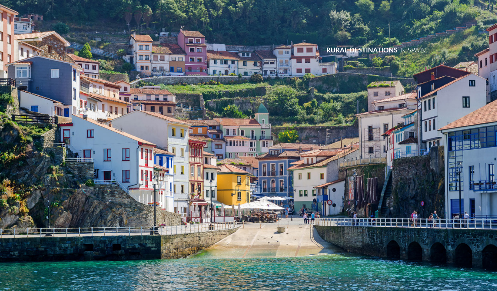
▲ CUDILLERO ASTURIAS