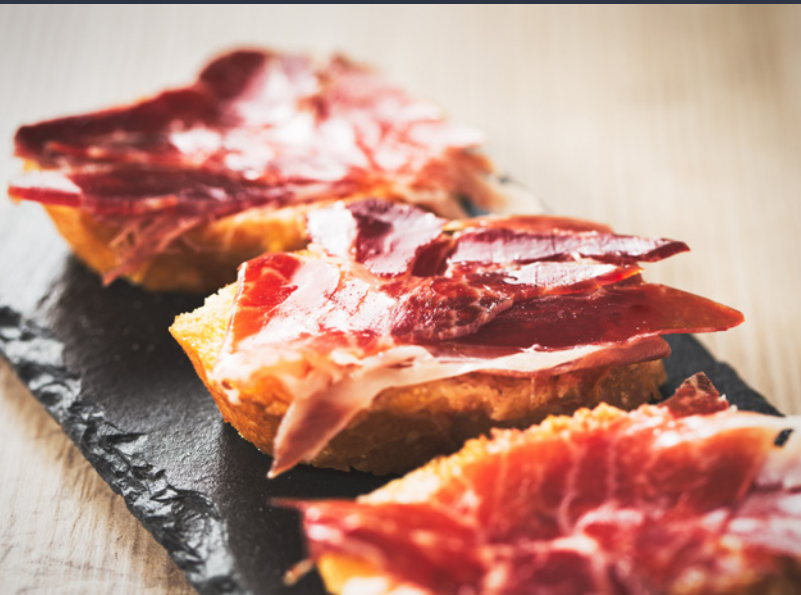
▲ IBERIAN CURED HAM