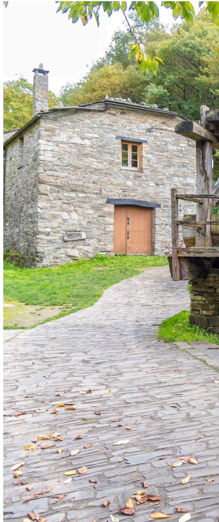
▲ TARAMUNDI ASTURIAS

❶ www.pazosdeg Galicia.com www.casonasasturias.com