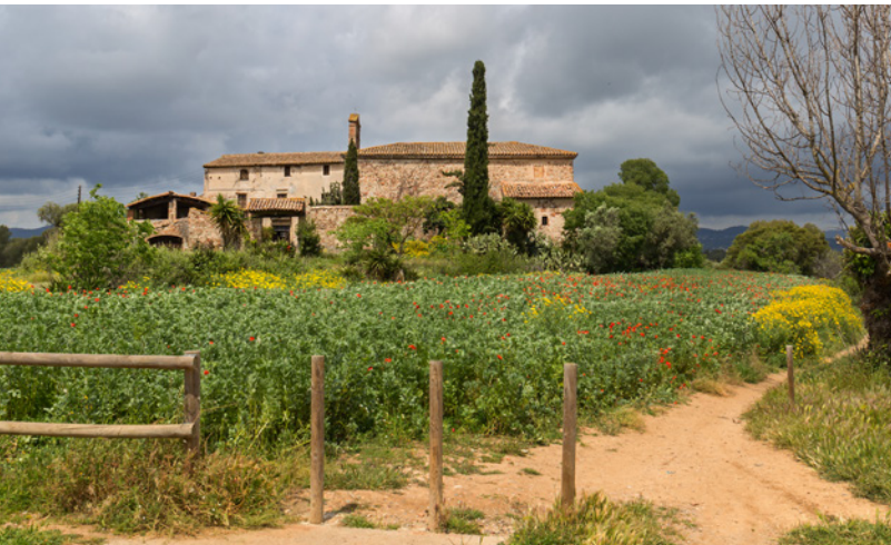
▲ CATALAN FARMHOUSE

The architectural origins for the masías in Catalonia and Valencia lie in the ancient Roman villas. Stone is the essential building material, together with sun-dried brick, roof tiles and slate. In the Valencia Region, especially in the area surrounding La Albufera Nature Reserve, you'll also find barracas , buildings with wide corridors and a traditional triangular roof made of wattle and straw.