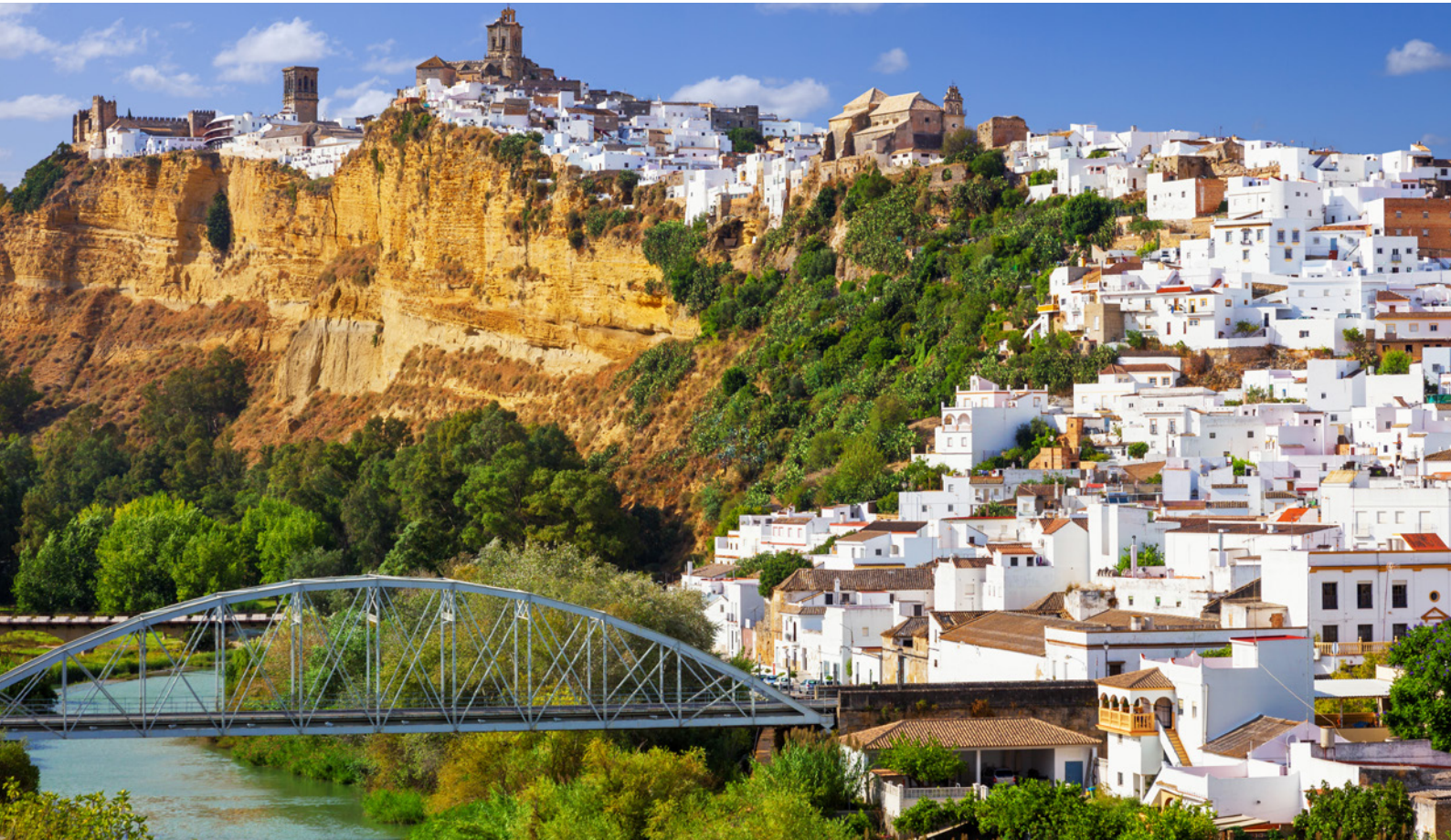
▲ ARCOS DE LA FRONTERA CÁDIZ

A different way of discovering the south of Spain. Tour the white villages, so called because of the white-washed houses. Rugged mountain ranges surrounded by olive groves and farmland, this land of traditions and excellent cuisine features olive oil and Iberian cured ham, two of Spain's great culinary treasures.