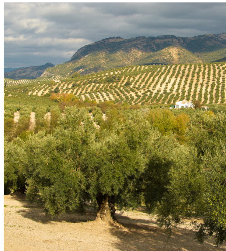
▲ BAEZA JAÉN

Sail on a sea of olive trees in the Jaén countryside, a paradise designated the world's capital of olive oil. Your day will start in the olive grove, picking the fruit that will be turned into the finest liquid gold. Once the olives have been picked they're taken to the olive press where they're processed and then the oil is stored, it will be an experience to remember.