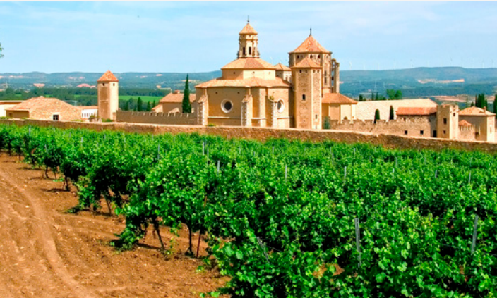
▲ VIMBODÍ I POBLET TARRAGONA

site delight. You can finish off with a visit to a local winery to stroll amongst the vineyards and take part in a tasting or workshop to discover the finer details of the different wines.