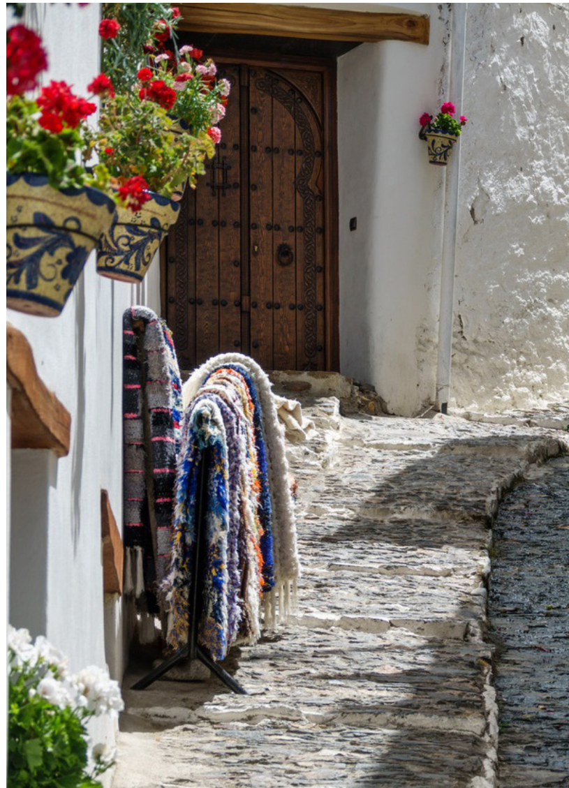
▲ ALPUJARRA GRANADA

Visit the Barranco de Poqueira district to explore Pampaneira , Bubión and Capileira , three picturesque villages