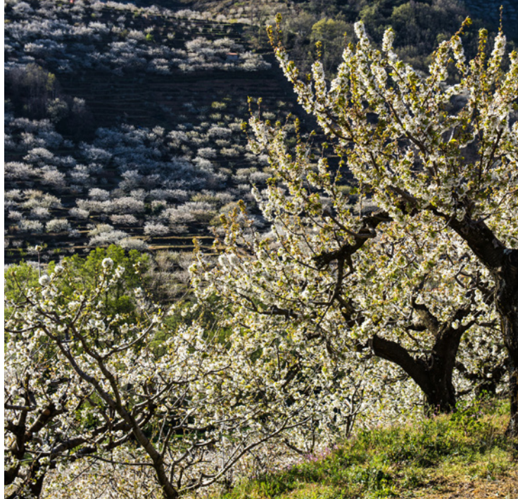
▲ CHERRY BLOSSOM FESTIVAL JERTE VALLEY, CÁCERES

Other interesting towns in the area are Los Guijuelos , Navacepada de Tormes and Navalguijo .