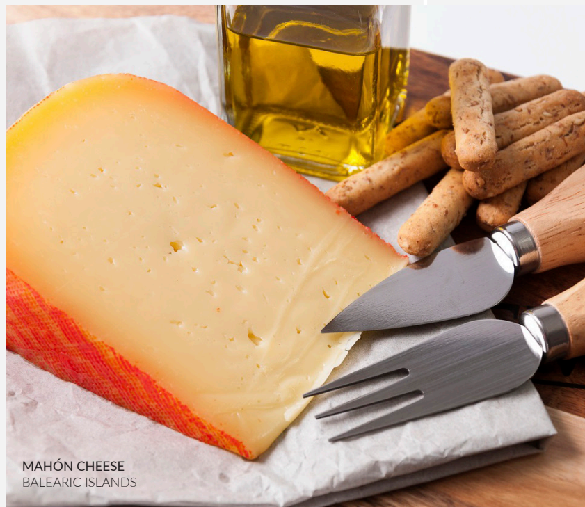
MAHÓN CHEESE BALEARIC ISLANDS

If you like sheep's milk cheeses, then you really have to try some añejo Manchego (cured for a year). In the green interior of Guipúzcoa in the Basque Country, a shepherd will teach how to make Idiazábal cheese in the time-honoured way, you can visit a traditional cheese dairy and try several types of this delicious product: white, smoked, young and cured.